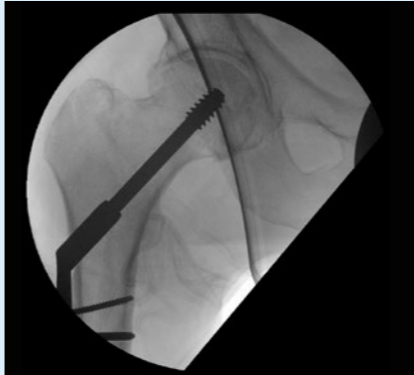
AP Hip - the BV Endura enhances image quality and manages X-ray dose by applying one shutter to visualize the dynamic screw.

Our full digital 1K 2 imaging chain includes powerful image processing functions, such as advanced noise reduction and 2D edge enhancement, providing high quality images time after time. It provides high quality fluoroscopy, subtraction runs, and roadmap guidance to support orthopedic, and vascular surgeons in performing challenging procedures. From complex fractures to minimally invasive vascular cases.