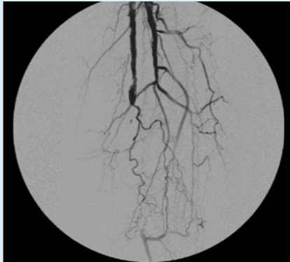
DSA angiography of the lower limb visualizes details of fine vessels with superb quality images.