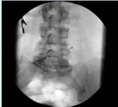
Pain management procedure – the BV Endura allows clinicians to visualize needle placement along the spine.