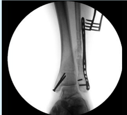
Ankle fracture – the BV Endura provides excellent image quality even without applying shutters to streamline workflow.