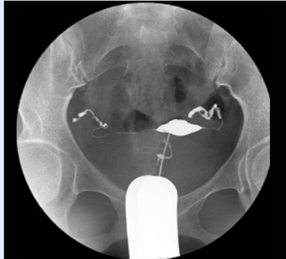
Hysterosalpingography - these procedures are increasingly being performed by mobile C-arm systems. The BV Endura provides excellent image quality to support these exams.