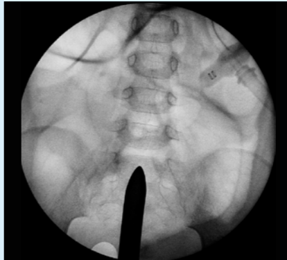
Pediatric abdomen - this image provides a high quality visualization of the entire abdomen at low dose levels.